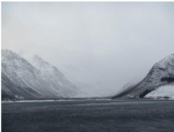
Svartisen Glacier was fogged in