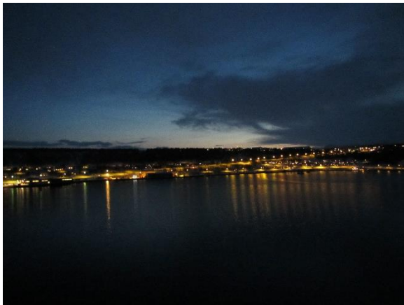
Sailing away from Tromsø in evening