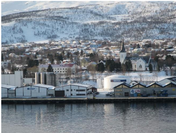
Sortland was sort of a wasted stop