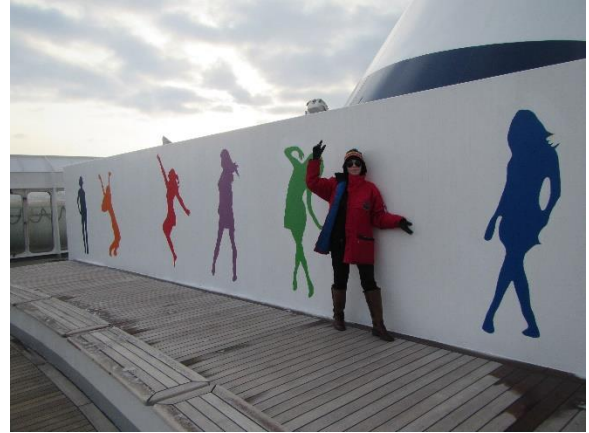
The ship does cruise the Caribbean as well where this design is more appropriate