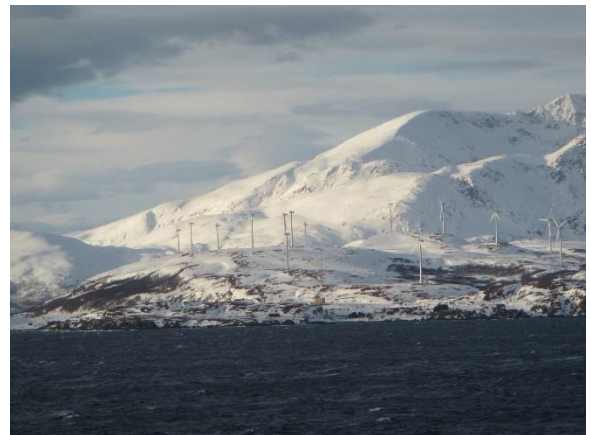
They make use of that wind