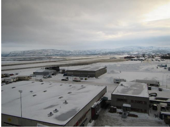
Tromsø, Norway docked by the airport