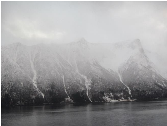
Romsdalfjord as we sailed south