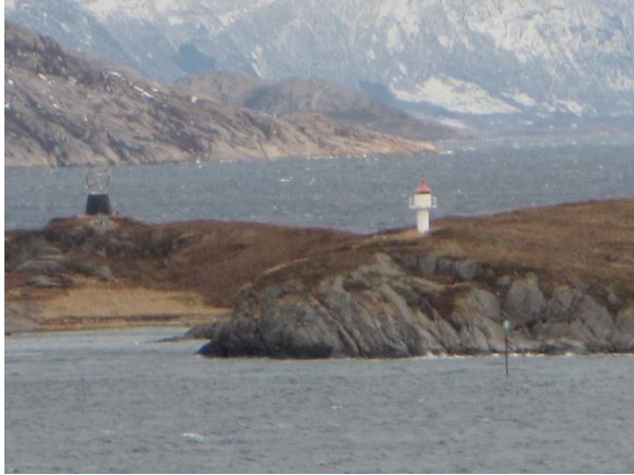
This is the marker denoting crossing the Arctic Circle