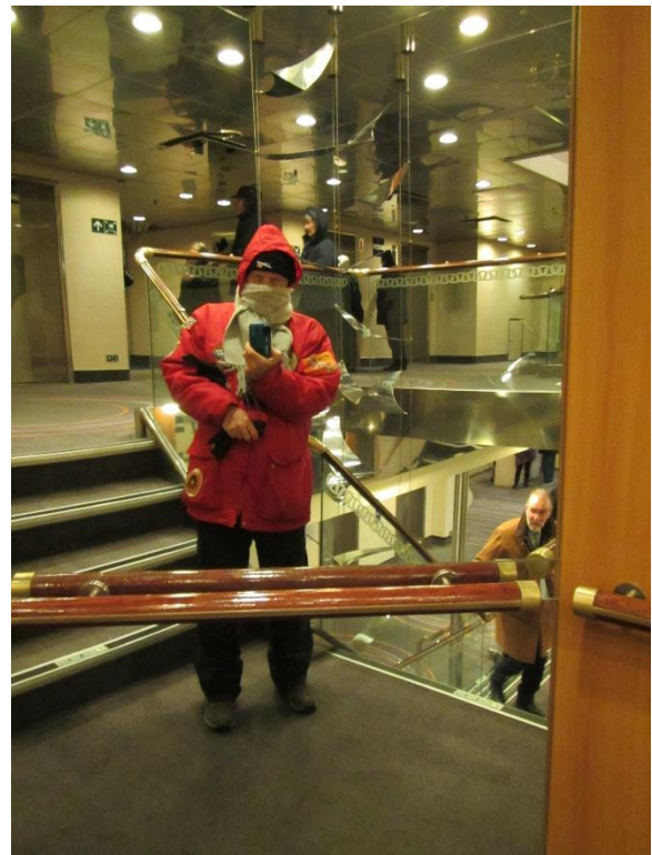
This is how I dressed for the deck at night