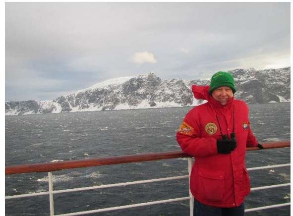
Winds got up to 70 knots