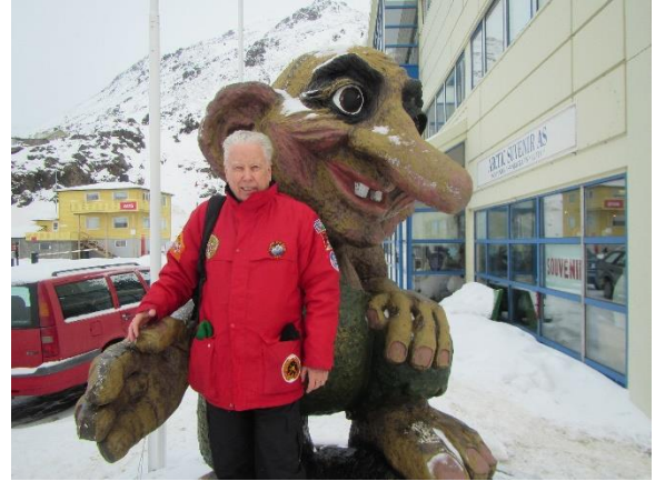
Trolls everywhere and we did see the Aurora that night