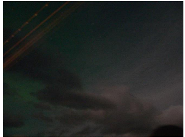
At times the lights were brilliant – other times more of a glow.