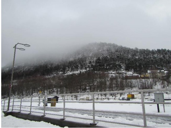
There was a brief stop in Andalsnes