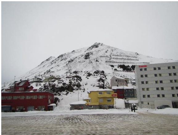
The hill above Alta

We learned that while Norway is in the EU, they don't take Euros and the price differential was significant. Advice is to convert before you leave as the cruise ship will screw you as well.