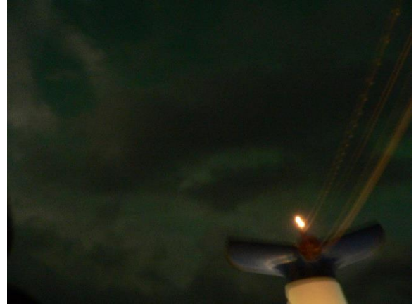
More of Doug's photos