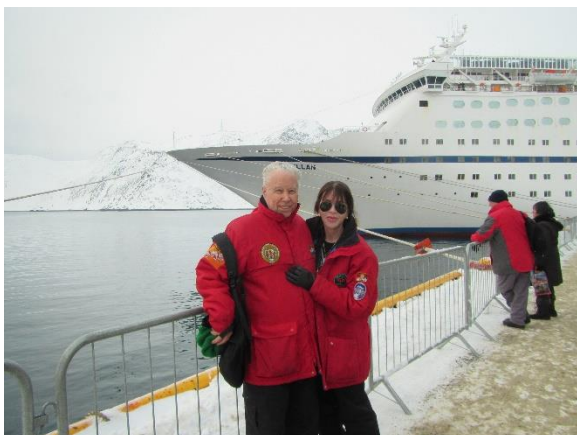
Magellan docked in Alta, Norway