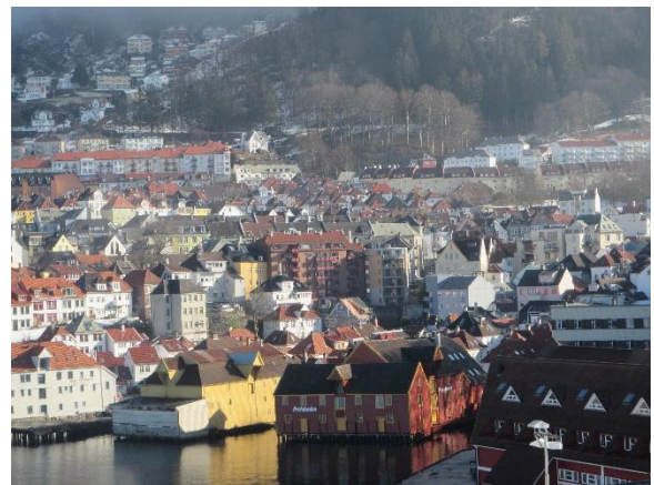
But it did clear in the afternoon