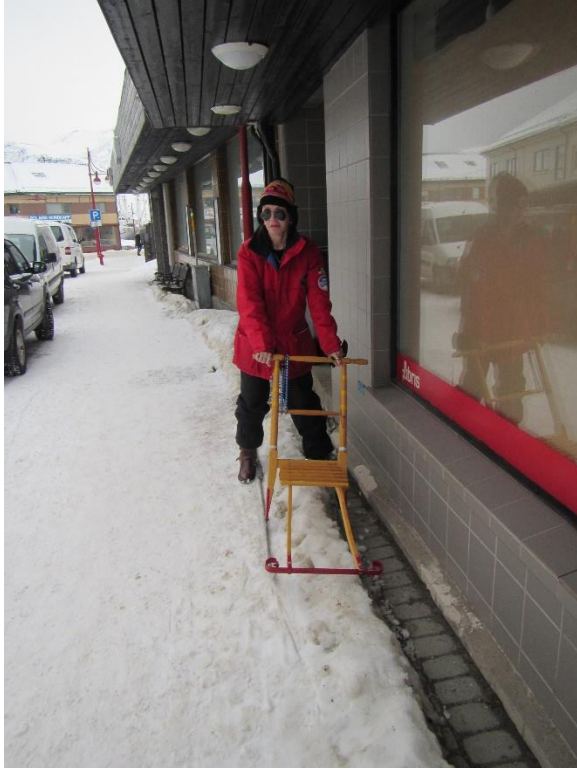
Victoria trying out the local transportation