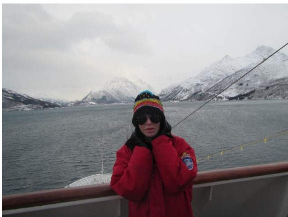
And it was getting chilly out