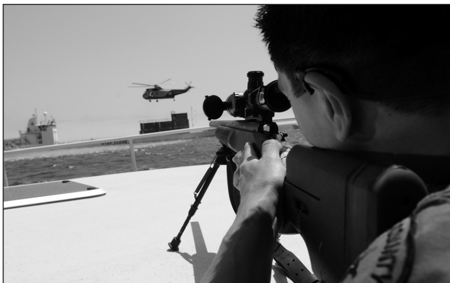
Figure 10. LASD sniper engaged in counterterrorism training exercise involving protection of shipping.

In many situations the sniper is employed to save lives. While that might sound counterintuitive, in both SOF and law enforcement, the sniper is often used to protect others. SWAT units resort to use of deadly force as a last resort. Unfortunately, movies and television have contributed quite negatively and produce an image of trigger-happy marksmen. The reality is far different; it is only in rare instances that SWAT snipers actually