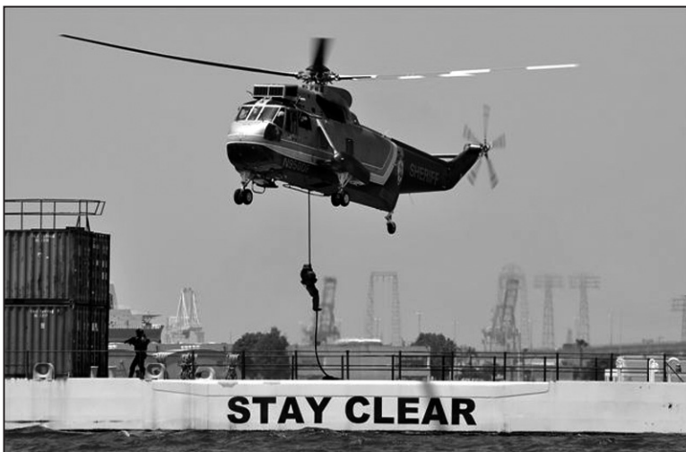
Figure 13. LASD SWAT team member executing a fast rope insertion onto a ship in a counterterrorism exercise.

Whether all areas of the country will have adequate response capability remains to be seen. Mentioned was the expense associated with developing and maintaining specialized units. National-level funding to accomplish that task could be provided, even though we are in a zero-sum environment when it comes to spending. While regional cooperation is improving, much more could be done. For local jurisdictions, having specialized units on a full-time basis is resource constrained based on the current tax situation. For departments in large metropolitan areas, maintaining SWAT teams is