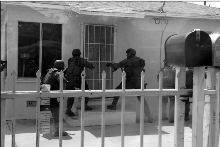
Figure 4. LASD SWAT practicing dynamic entry for service of high-risk warrants.