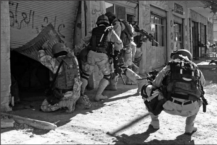
Figure 3. SOF conducts dynamic entry in search of high-value target in Iraq.

apparent, but in ways unanticipated. It was the SOF involvement in the legal aspects of mission execution followed by criminal prosecution that was totally unexpected. In most incidents, they were serving as advisors to Iraqi officials who were technically in command of the operations. Still, the SOF personnel found themselves integrally involved in the Iraqi legal system.