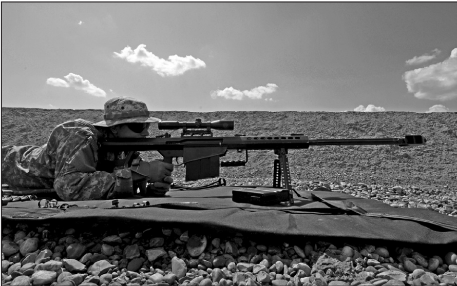
Figure 9. SOF sniper training in desert environment.

One aid in dealing with cross-jurisdictional manhunts is that sheriff's deputies also can be sworn as U.S. Marshals. This capability may allow the suspect to be arrested by officials from the original jurisdiction of the crime and expedite extradition. International cases are considerably more difficult. Even if the suspect's whereabouts is known, the time and expense required for international extradition makes such processes reserved for only the most egregious crimes. 153