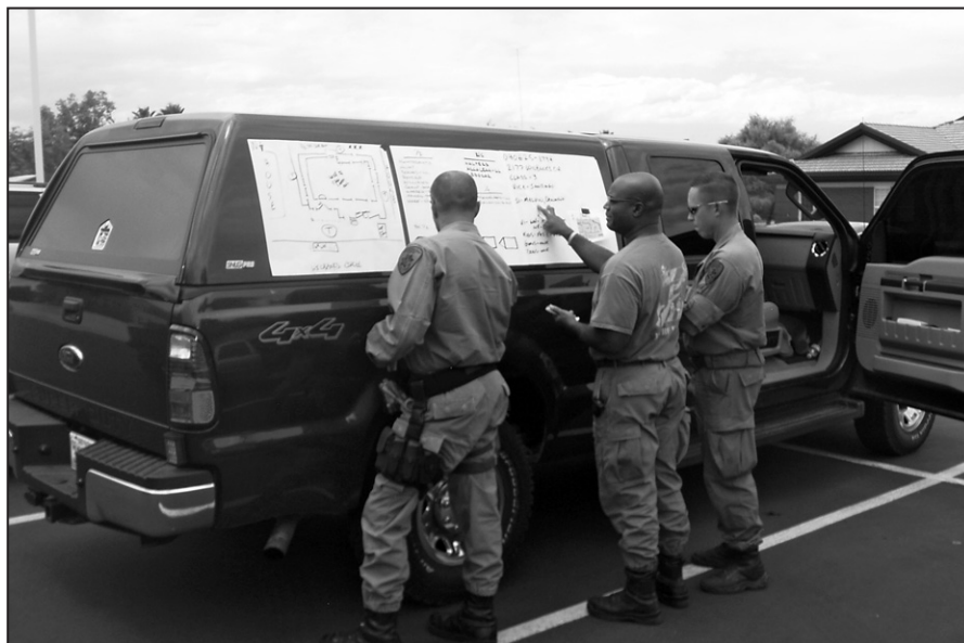
Figure 8. Las Vegas SWAT team prepares to execute a high-risk warrant. Every team member is briefed on assignments and confirms equipment to be carried.

The planning process is repeated in great detail, even when the unit is executing several warrants in a single day. Like with military missions, while operations may be similar, no two are identical. 143