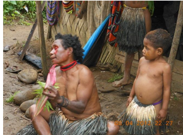
Not happy with polygamy, this woman makes a talisman to keep other woman away from her husband. Twice she severed digits from her left hand because she was mad at him.