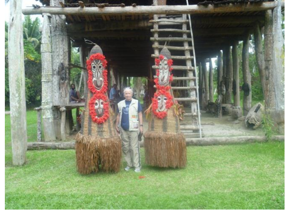
At another spirit house