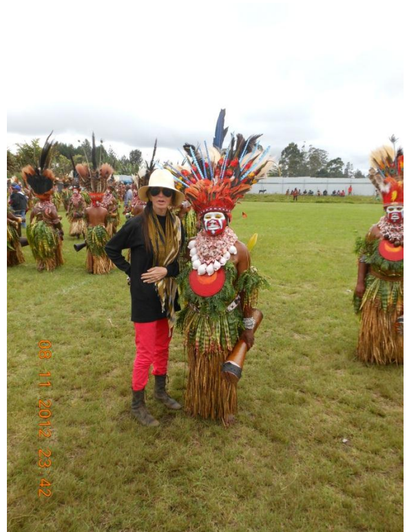
And much, much more