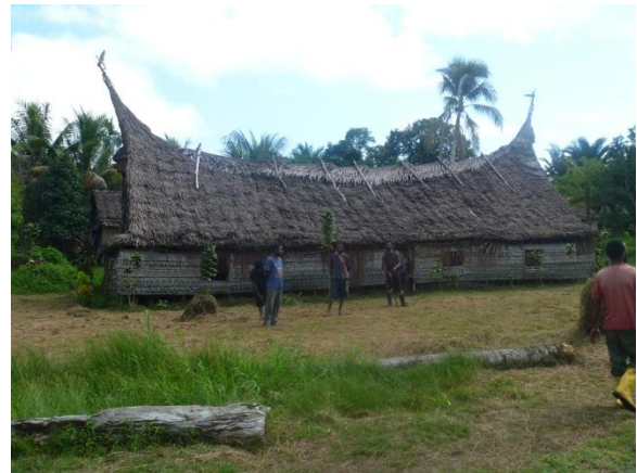
Women dance separately in their hut.