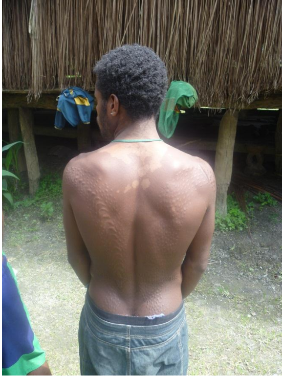
Many men are intentionally scared as homage to the crocodiles that live there. This medium-size one is 13 feet long.