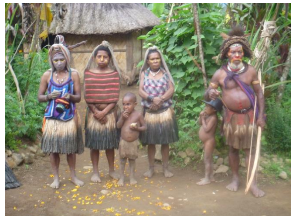
A chief with his wives. They are bought for between 10 and 30 pigs. The wives live with the pigs. Men live in a separate hut and heterosexual sex limited and mostly for procreation. Not mentioned, though prevalent, are homosexual encounters.