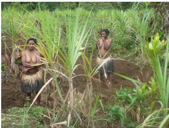
The women plant sweet potatoes in a most primitive fashion. The pigs assist them in the gardens.